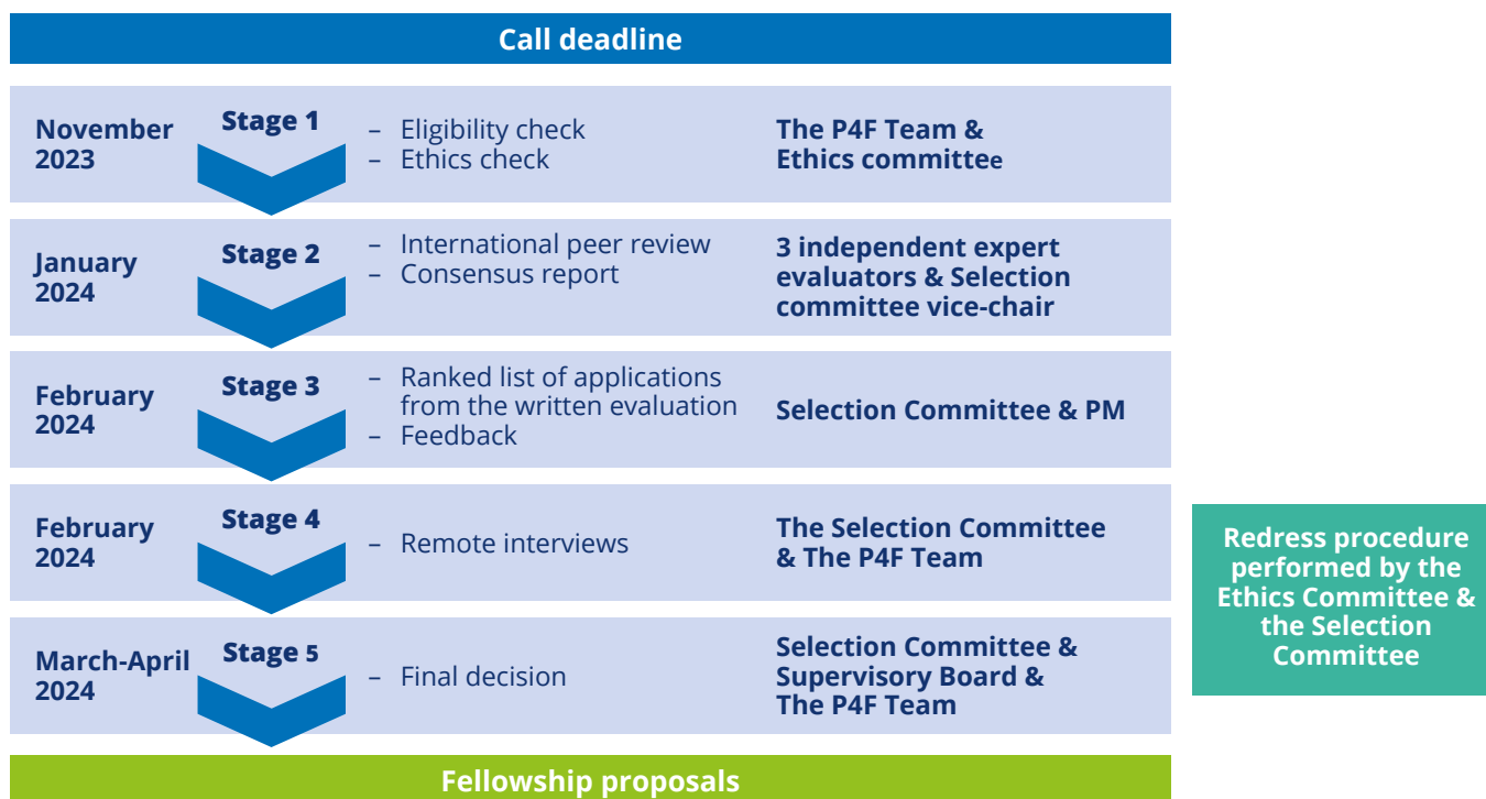
Fig. 2 – The P4F evaluation and selection process.